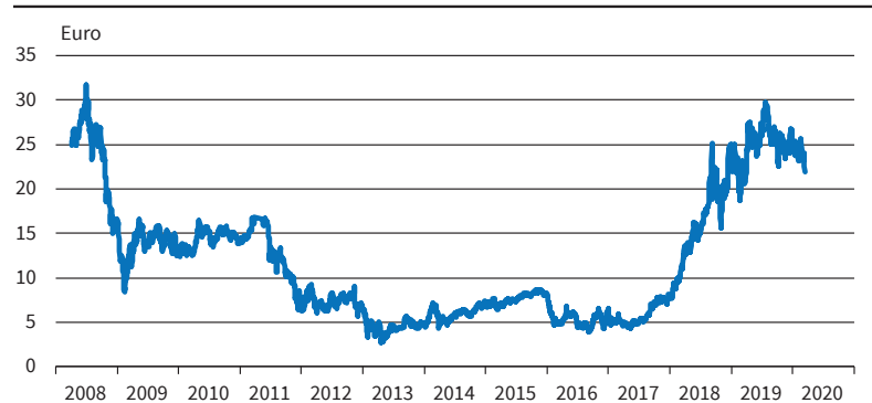
Figure 3 Futures Prices EU ETS Allowances

Notes: Non-adjusted Euro price based on spot-month continuous contract calculations.