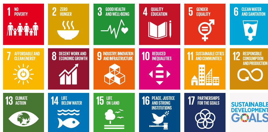
Figure 1.1 The Sustainable Development Goals